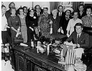
June 10, 1963: John F Kennedy signs the Equal Pay Act into law. Almost four decades later, men's and women's salaries have yet to reach parity.